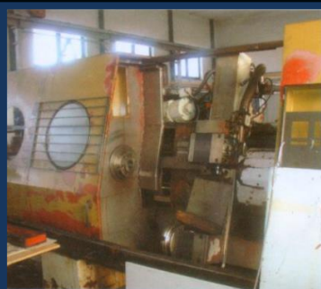
Lathe before modernization